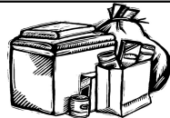
Donations for the Day School

Please put these in the box in the foyer.