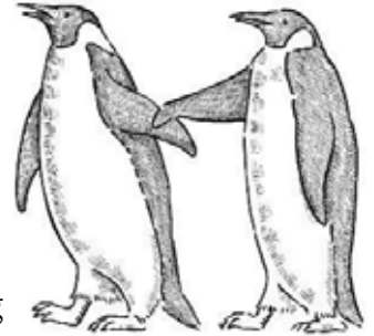
Bring a friend next Sunday

Next Sunday will be a Friends and Family Day for us! Please plan to be here and bring a guest! We'll have our