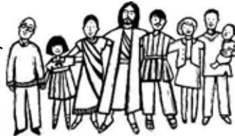
A world with Christ